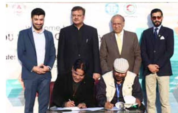
MOU Signed with Pakistan Red Crescent