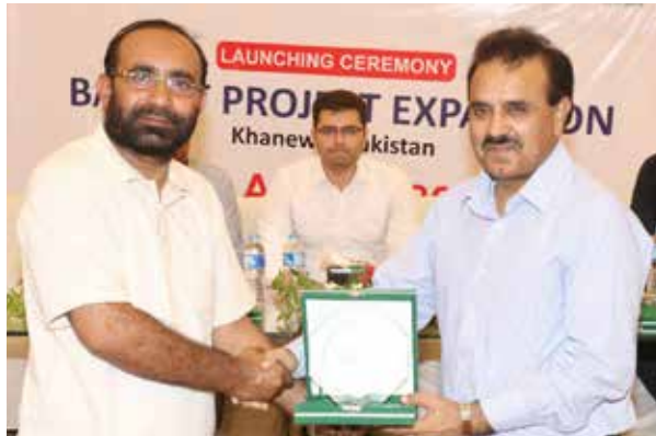
Chairman The NGO World Foundation presenting souvenir to Deputy Commissioner Khanewal at Barkat Project Launching ceremony. Country representative of TIKA was also participated.