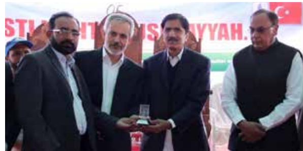
President Deniz Feneri along with Provincial Minister of Livestock, Punjab and DCO Layya presenting award of appreciation to Chairman The NGO World in recognition of work for flood victims 2010.