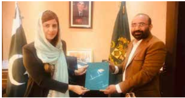
Chairman The NGO World presenting profile to Zartaj Gul, Minister of Climate Change Govt of Pakistan