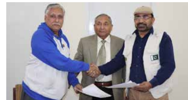
MOU Signed with REDO