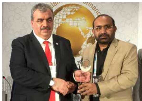
Chairman The NGO World received award for Barkat project during World Halal Summit Istanbul-Turkey