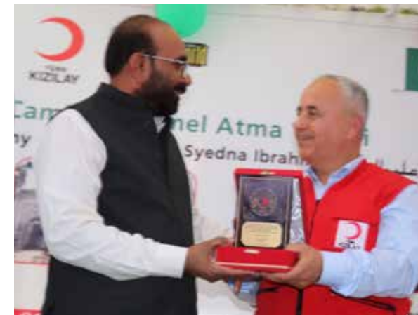
Secretary General Turk Kizilay Appreciated The NGO World