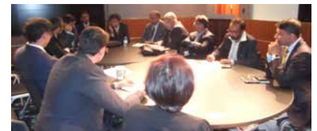
Chairman of TNW Foundation was honored to be part of Pakistani delegation to participate The World Innovation Summit for Education (WISE) managed by Qatar Foundation in October 2013 in Doha-Qatar