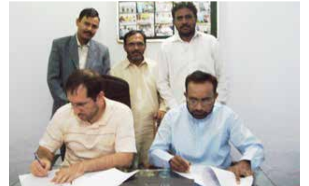
MOU with Deniz Feneri