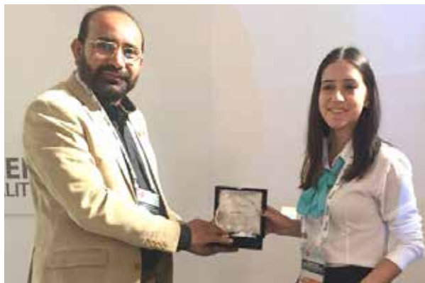
Acknowledged for managing one day capacity building workshop during “International City and Civil Society Organisations” summit 20-22 October 2017 at Yildiz Technical University Istanbul.