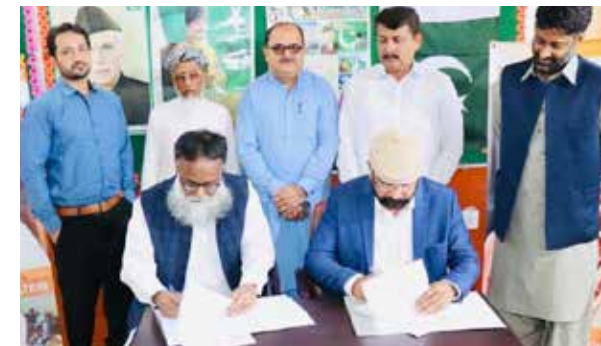
MOU Signed with GEAR