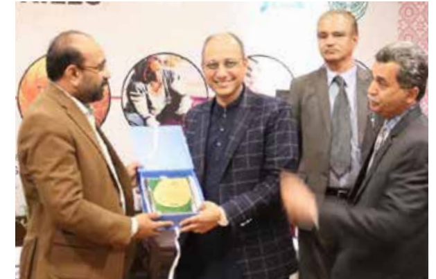
Received Award for ZEST Pproject at Karachi-Pakistan