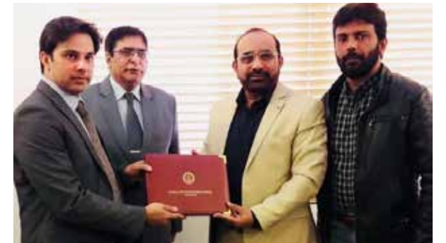
MOU Signed with NIBAF