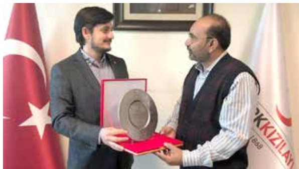
Head of Delegation Turkish Red Crescent presented shield of honour to Chairman The NGO World at his office in Islamabad