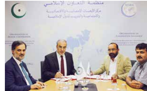
MOU Signed with SESRIC