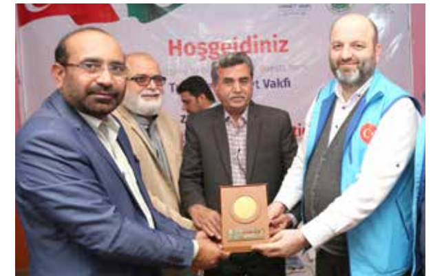
Chairman The NGO World presenting shield of honour to president of Türkiye Diyanet Vakfı during his visit to ZEST project in Karachi-Pakistan