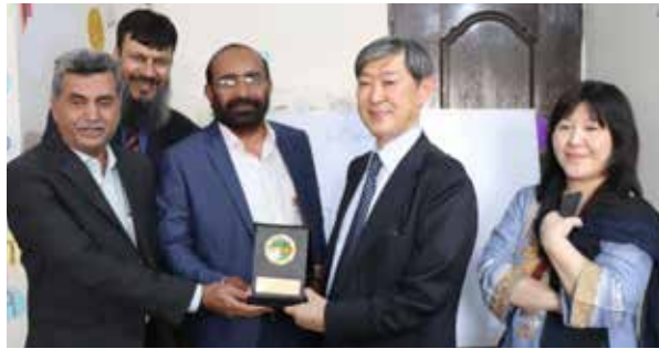
Chairman The NGO World presenting shield of honour to president of JICA during his visit to ZEST project in Karachi-Pakistan