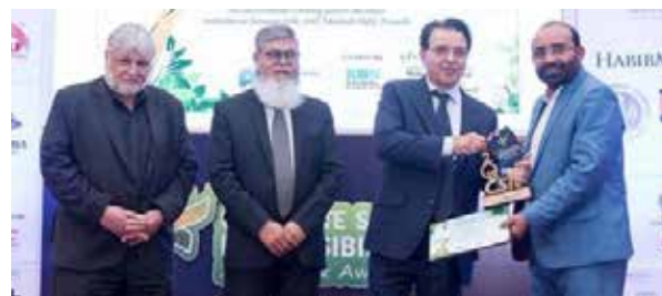
Chairman The NGO World receiving CSR Award at CSR Summit 2018 Karachi.