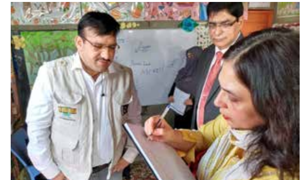
Comments for ZEST by Secretary Literacy & Non-Formal Basic Education, Govt. of Punjab