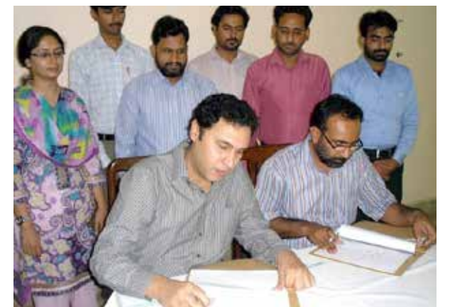
MoU with YES Network Pakistan