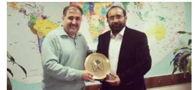
Chairman The NGO World presenting souvenir to Secretary General of Deniz Feneri at his Istanbul's office