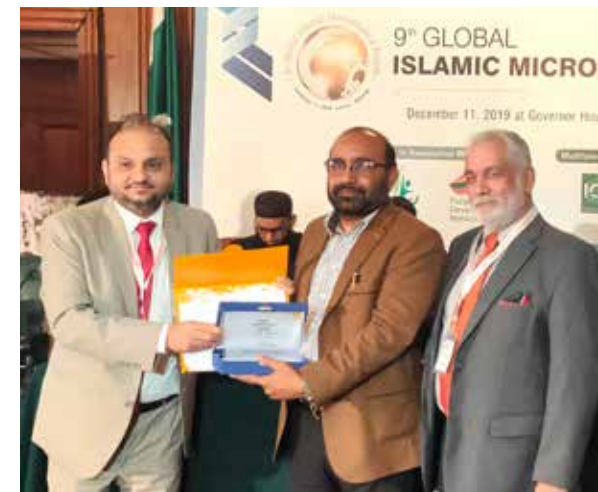
Chairman The NGO World received award for Barkat project during Global Islamic Micro Finance Forum at Governor House Lahore-Pakistan