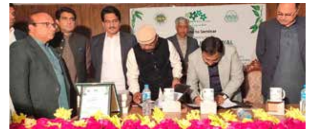
MOU Signed with Dipputy Commisioner Khanewal